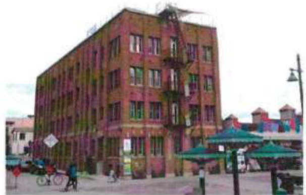
2 Breeze- 31 unit RSO apartments