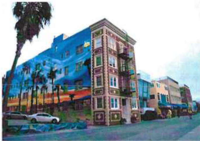
417 Ocean Front Walk- 32 unit RSO apartments