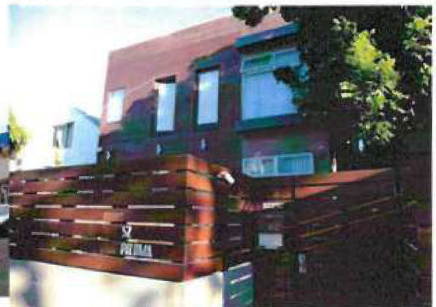
52 Paloma- 8 units RSO apartment- Mr Lambert recently sold this building but operated previously Paloma Suites.