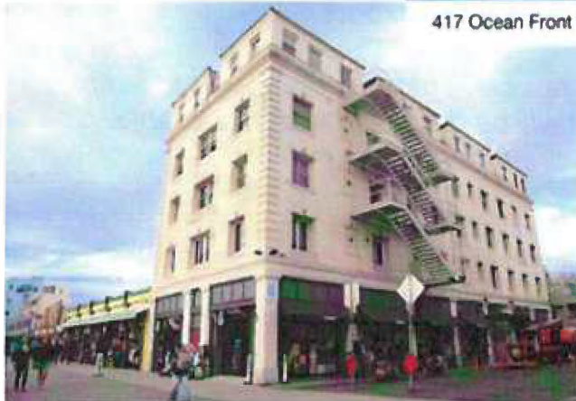
The Waldorf- 32 unit RSO apartments